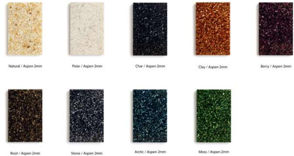
Colour range / Aspen 2mm

Woodio Hooks are available in 2 mm aspen as the base.